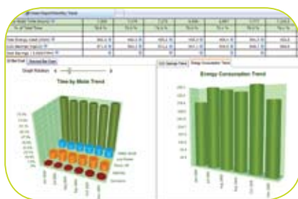
Track trends in energy consumption over time