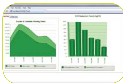
Translate usage data into reports that detail CO 2 reduction trends